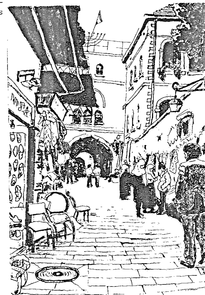
The Old City - Arab Quarter

All accommodation will be allocated on a first come, first served basis. If we receive bookings after our allotted accommodation is filled, we shall find hotel rooms in downtown Jerusalem at an equivalent cost on a bed and breakfast basis. However, we cannot guarantee that such rooms will have the same excellent facilities as the Maiersdorf because that is subsidised by the University. Members so accommodated would take their dinner at the Maiersdorf but would have to make their own arrangements for transport to and from the hotel.