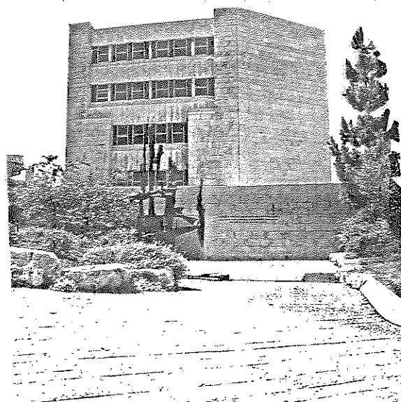
The Maiersdorf Faculty Club

Buses and taxis run from the airport to Jerusalem (35 miles) but no bus runs directly to Mount Scopus. Members would have to change buses at the Central bus station, a daunting prospect for the weary traveller! A bus will return members to the airport on Wednesday 27th March, to connect with EL AL flight LY015 to London and New York.