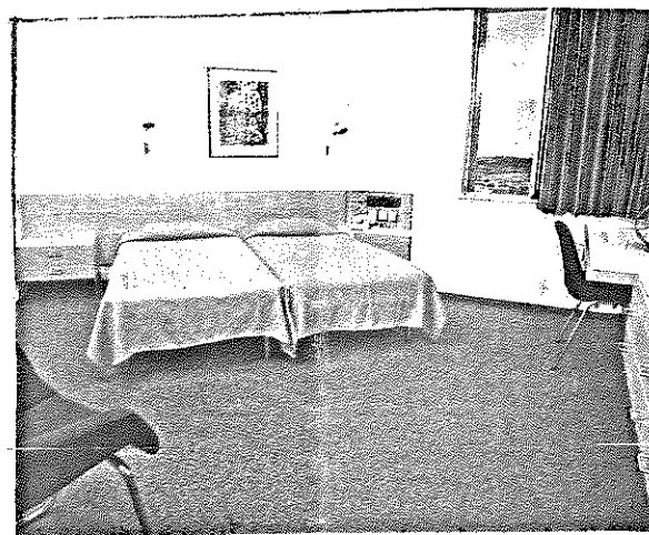
Double room at the Maiersdorf Club

NB. The Maiersdorf Faculty Club is a much smaller building than we have used in the past and so accommodation will be very limited. For this reason, no single rooms will be available. It would therefore be most appreciated if members coming on their own were prepared to share triple rooms, for which a reduction will be made.