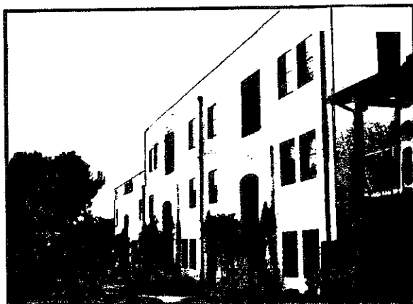
The Henry George Complex in Linda Vista of Basic Economic Education, Inc., 2200 Morley St., San Diego, CA 92111 (619)560-LAND