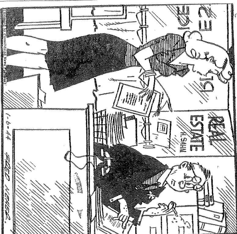
"Oh, yes, I know what a deed is.. you're supposed to do a good one every day."

"I am somewhat elated and inspired because it will give me a great deal of personal satisfaction if I can be instrumental in starting an extension course from your school."